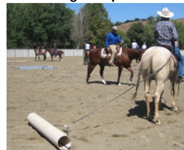
Willing Partners™ horses demonstrate in the Riding with Respect clinic Aug. 2010