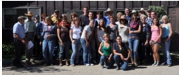
Monty Special Training 2010

September 18th-19th: Horsemanship 101 September 27th - October 1st: Introductory Course exams October 4th - 22nd: Advanced Course November 1st - 4th: Join-Up Clinic November 5th - 6th: Longlining Clinic Book Now! Email: info@join-up.org or call +1-805-688-3483